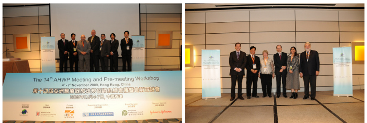
Speakers & moderators for the 14th AHWP Pre-meeting Workshop