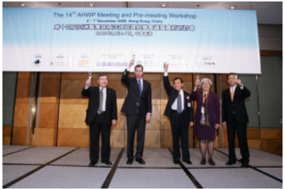
Toasting ceremony for AHWP Luncheon