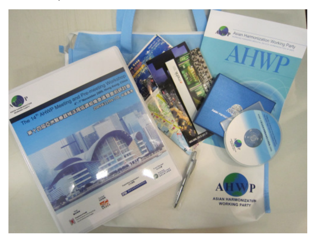
Figure 1 Document Bag of AHWP Meeting

HKPC was responsible for preparing the meeting documentations and materials, including the collection, proof-reading, editing and printing of meeting documents, design and production of meeting bags, liaison with State Food and Drug Administration for production of the "Collection of Medical Device Regulation from AHWP Main Member Economies (2009)" VCD, liaison with Medtronic Inc for the souvenirs and liaison with the Hong Kong Tourism Board (HKTB) for Hong Kong Map and stationery.