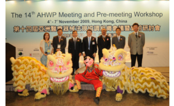
Guests of AHWP cocktail reception

The 14th AHWP Meeting Cocktail Reception (5 November 2009), Luncheon (6 November 2009) & Gala Dinner (6 November 2009)