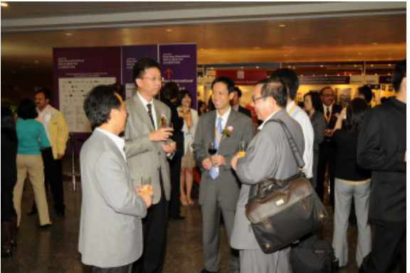
Participants of AHWP cocktail reception