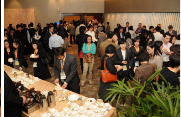
Participants were sharing their experience during the tea break of the 14th AHWP Pre-meeting Workshop.