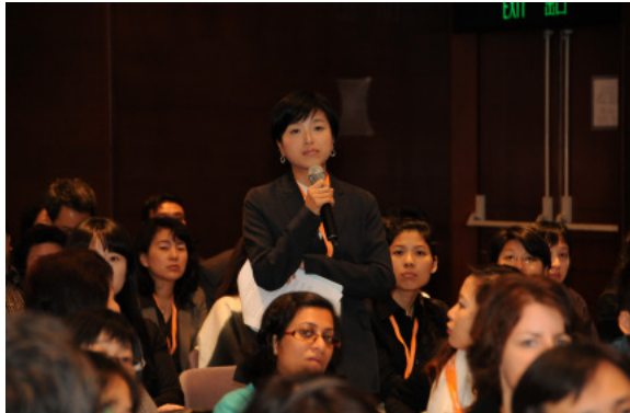
Interactive Q&A session was held during the 14th AHWP Pre-meeting Workshop.