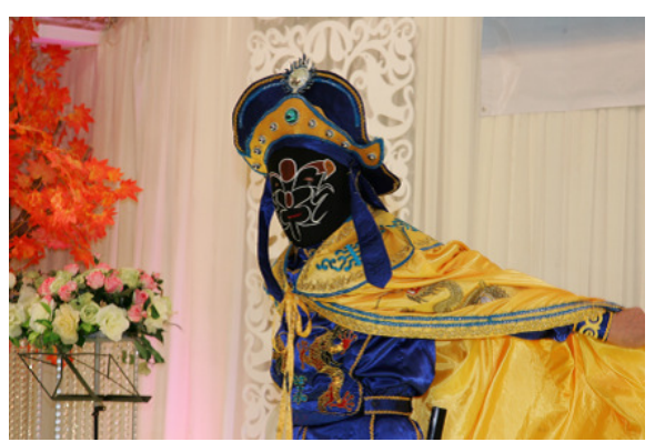
Cultural performance during Gala Dinner