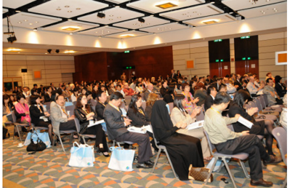
Participants for the 14th AHWP Pre-meeting Workshop