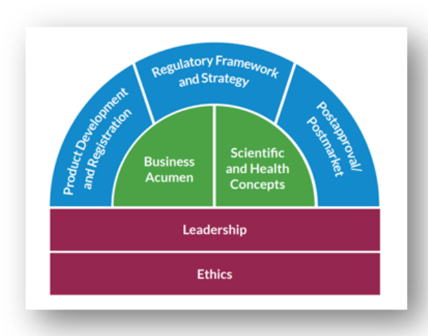
RAPS Competency Framework Domains

We also use content from industry partners, health authorities and governmental agencies.